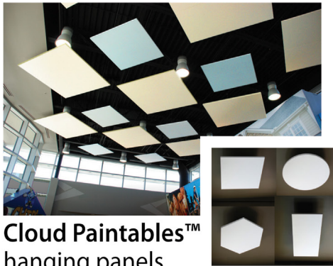
Cloud Paintables™ hanging panels