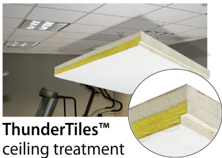
ThunderTiles™ ceiling treatment