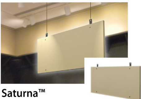
Saturna™ hanging baffles